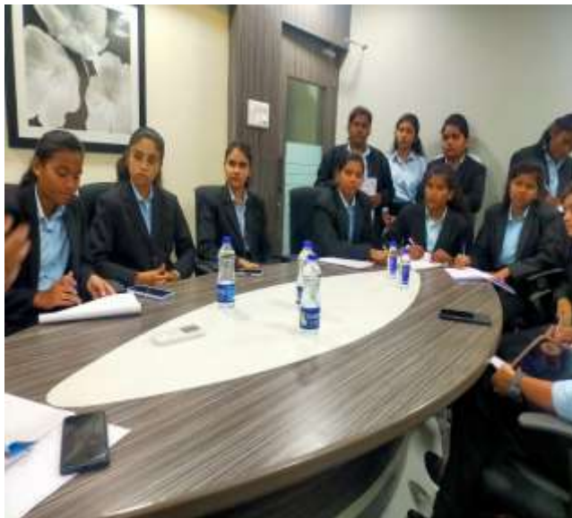
Students Interaction with the Bank Manager