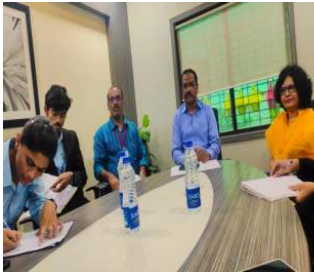
Students and Staff Interaction with the Bank Manager