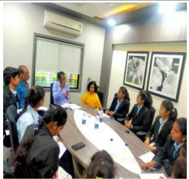
Students and Staff Interaction with the Bank Manager